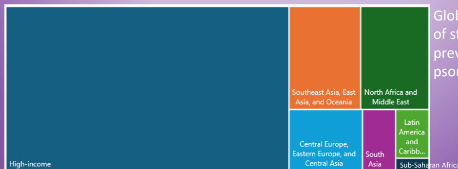
Global distribution of studies on the prevalence of psoriasis to 2024